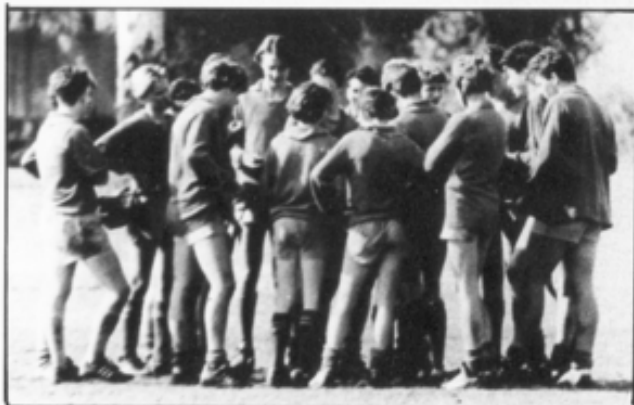
GAZZA'S HALFTIME ADDRESS