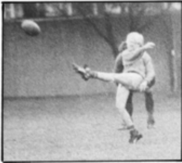
ONNY SINKS THE SLIPPER