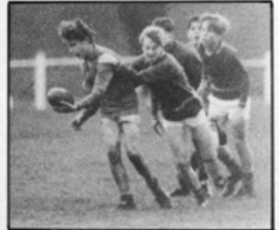
BROWNY GETS COLLARED