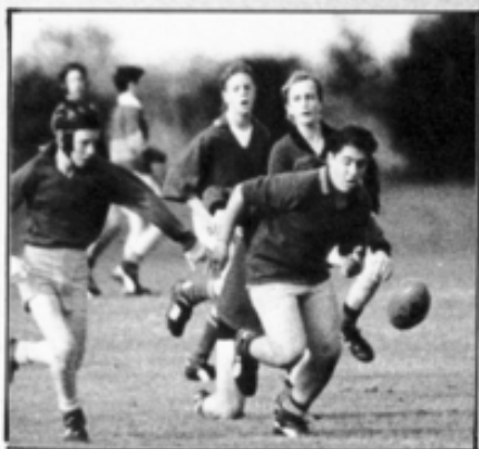
TOSH THE RACEHORSE