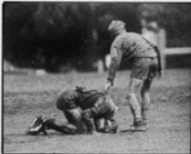
"GET UP YOU WOOS!"