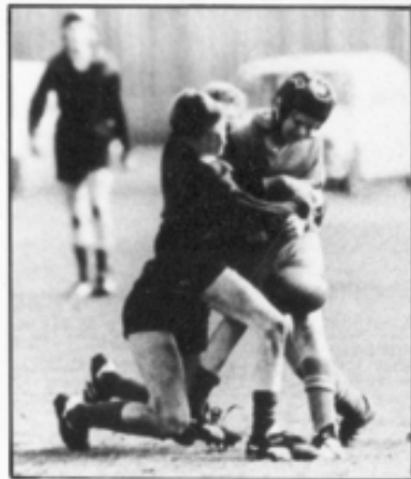
"LET ME GO YOU BULLIES"