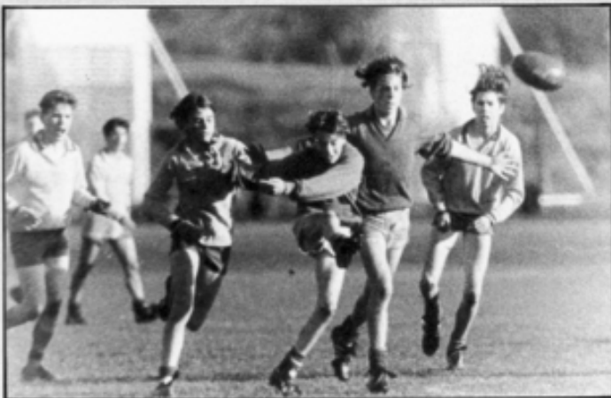
A CLEARING KICK