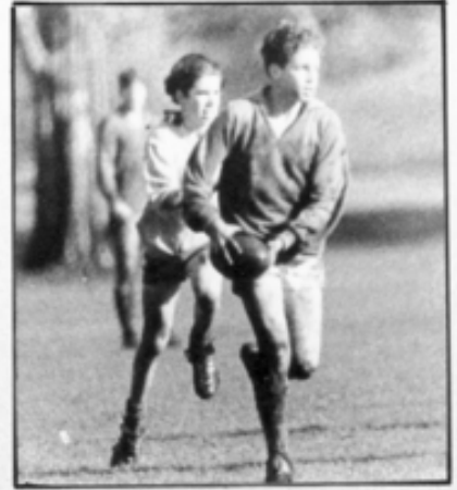
LEWSKI LINES UP THE STICKS