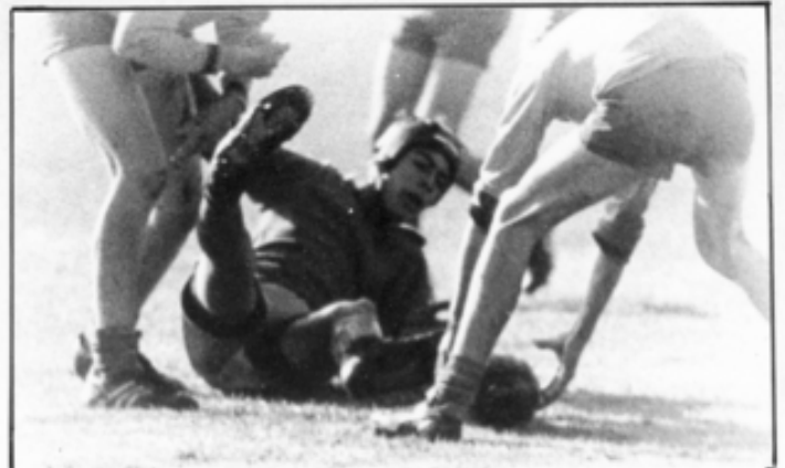
"THIS IS NOT MY BEST ANGLE!"