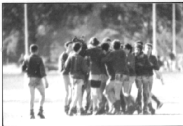
"DID WE WIN?"