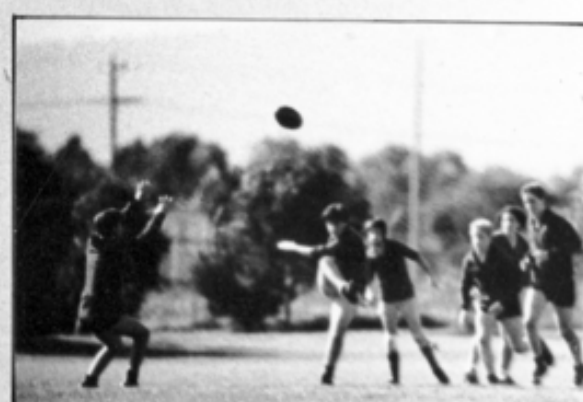
TUBBSY TORPS IT