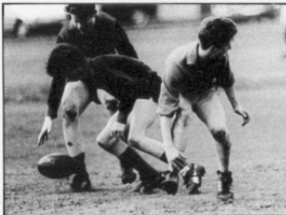
"WHERE DID IT GO?"