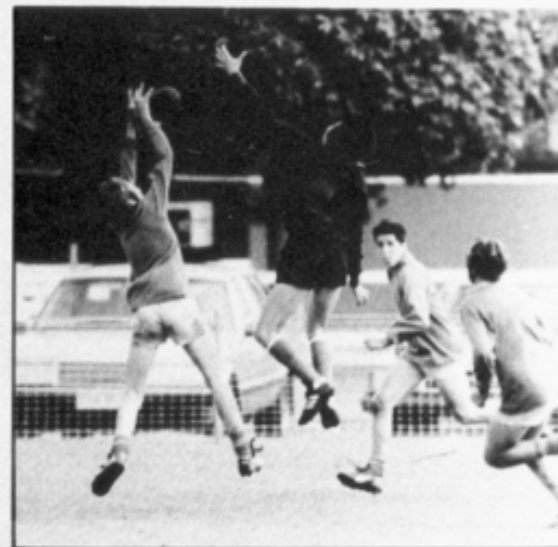
"THAT'LL BE MINE THANKS!"