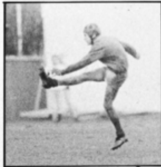
CHAMPS THE CHAMP