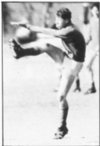
ONE FROM THE COACHING MANUAL