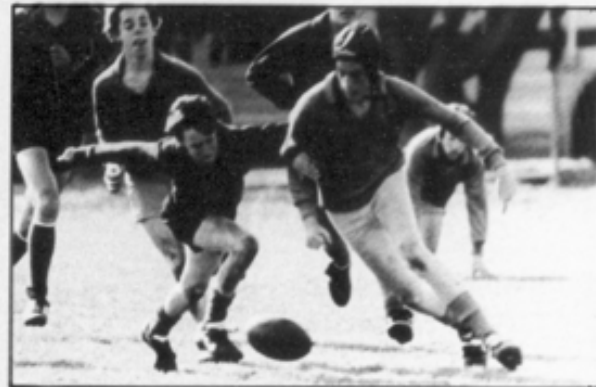
"OUT OF MY WAY SHORTY!"