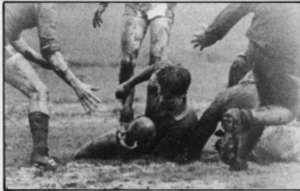
"OH NO! IT'S STUCK!"