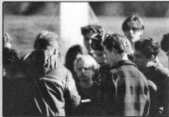
"NOW, THIS IS THE PLAN..."