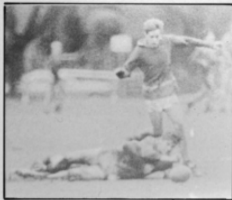
KEEP YOUR FEET GAZZ!