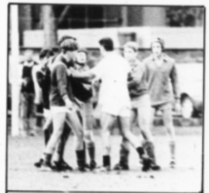
"LET'S PLAY FOOTY FELLAS!"