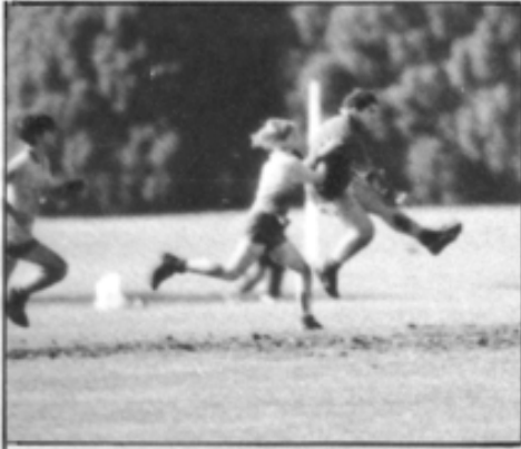
TOSH IN FULL FLIGHT