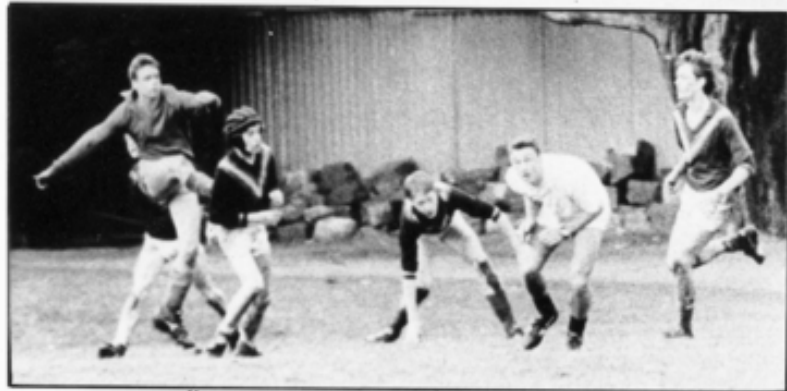
"LOOK OUT BELOW!"